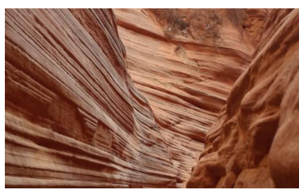
Valley of Waves