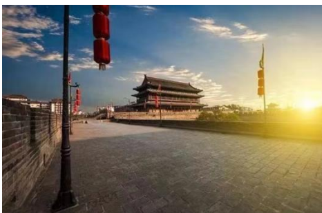
Xi'an Ancient City Wall