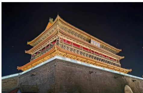
Xi'an Ancient City Wall