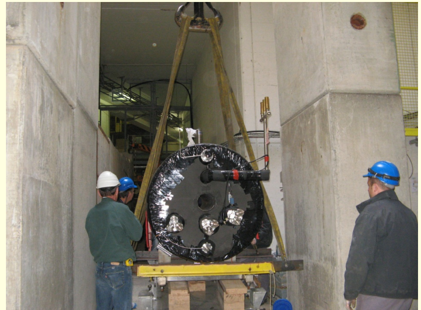
I.Efthymiopoulos - CERN