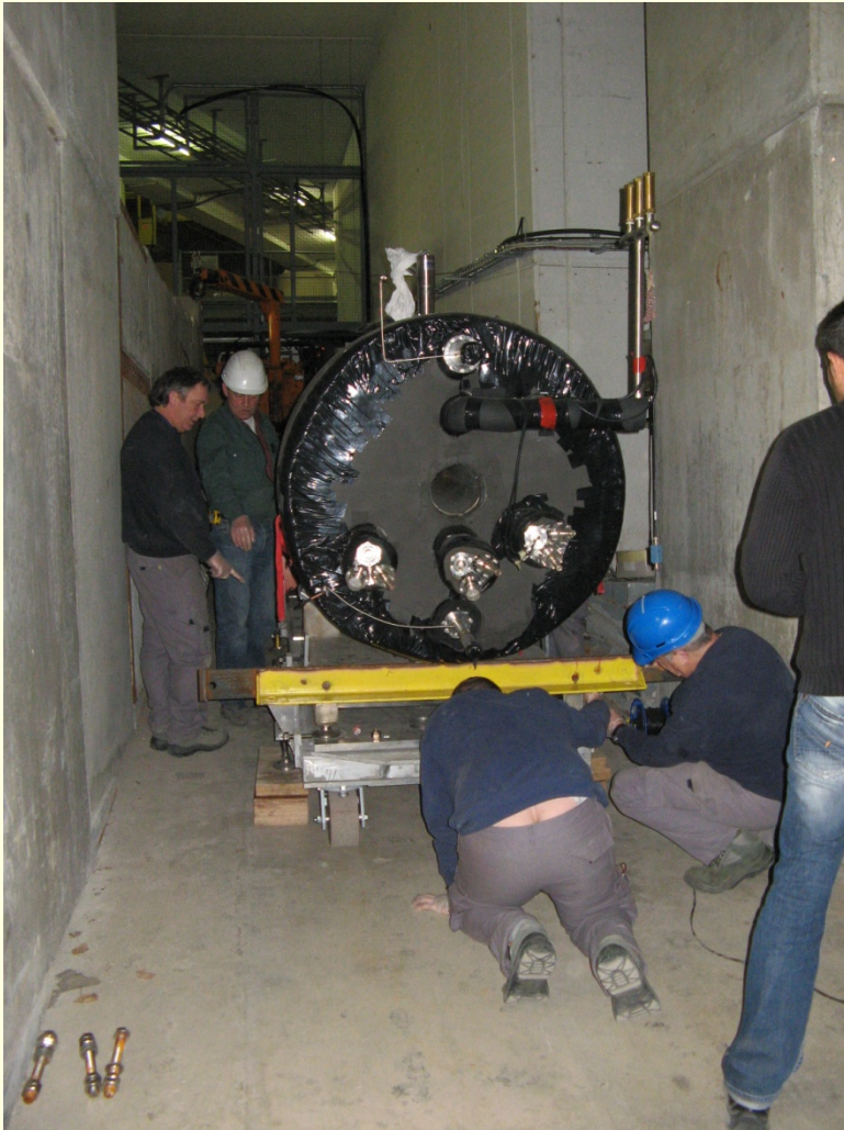
March 26, 2008