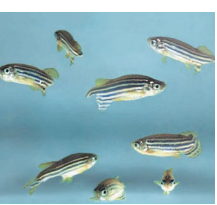
Variety shoal: zebrafish with the mini fin gene, one of a host of mutants known in the species.

Scientists at Artemis will mainly screen for abnormalities giving information on gene function that could provide leads for drug development. These include