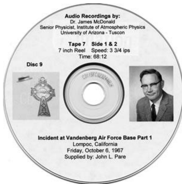
(Fig. 2) Image of CD-R Tape 7, Side 1 & 2, 7 inch reel, Disc 9.

5. CD burning and labeling of each CD and/or DVD. I had to create a separate label, corresponding to Dr. McDonald's original reels. (See Fig. 2)