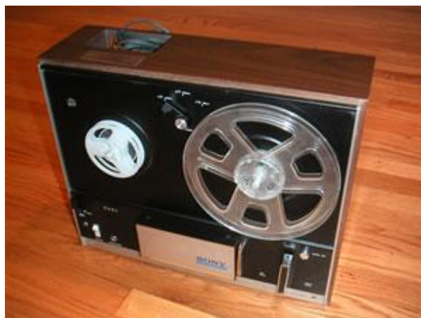
(Fig. 4) Vintage Sony TC-155 reel to reel tape player.

After some time it got to the point that Vince Uhlenkott's tape player/recorder started also having playback problems. Since we both knew that we would eventually need another playback machine that could playback 1 7/8 ips speed, Vince told me to go ahead and look on eBay for another one. I was able to eventually find a really clean vintage reel to reel Sony TC-155 player. (See Fig. 4).