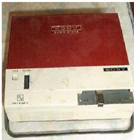
(Fig. 3) Vintage Sony TC-123 reel-to-reel tape recorder.

I tried to use this recorder to record the 3 inch, 1 7/8 ips reel to reel tapes into my computer, but again this machine was old, belt driven and also had playback speed problems. It also had problems with major hum once it was connected to my computer for recording, due to the fact of grounding problems.