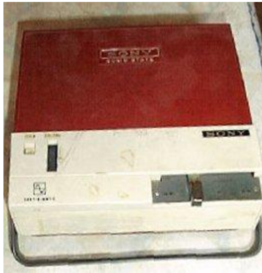
(Fig. 3) Vintage Sony TC-123 reel-to-reel tape recorder.

I tried to use this recorder to record the 3 inch, 1 7/8 ips reel to reel tapes into my computer, but again this machine was old, belt driven and also had playback speed problems. It also had problems with major hum once it was connected to my computer for recording, due to the fact of grounding problems.